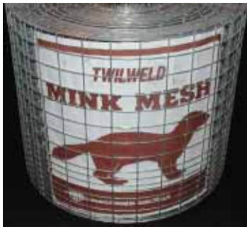
W072 (1/2" X 1" X 1 1/2" X 12")

REMEMBER On all wire, the last measurement goes around the roll. 1/2" x 1" mesh has a wire pattern that will produce 1" of waste per cut. A 1" x 1/2" pattern will produce 1/2" of waste per cut that must be trimmed to eliminate sharp ends. And in 1" x 2" mesh you lose 2" per cut!